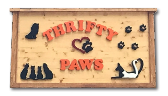
HOURS every Friday 2:00 to 5:00 and Saturday 10:00 to 2:00

Thank all of you that donate and shop at THRIFTY PAWS. This is the main project that runs all of our services to our LOCAL community!